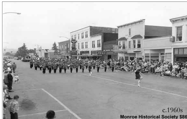
c.1960s Monroe Historical Society S864

Seek funding sources to support DREAM-sponsored programs and activities.